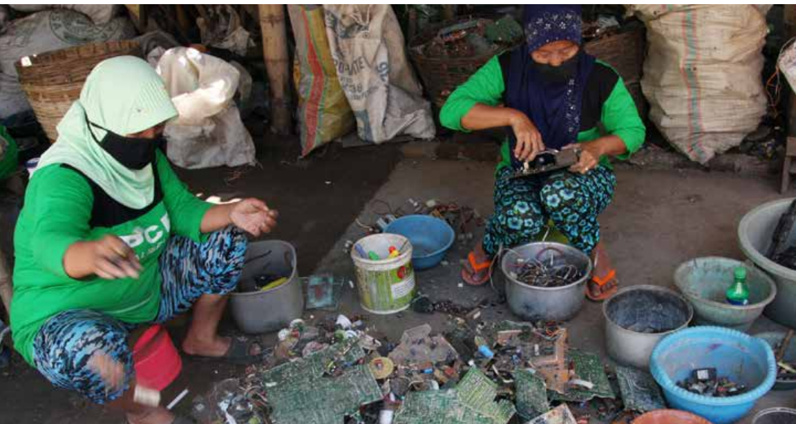
TWO FEMALE WORKERS IN MOJOKERTO AREA ARE DISMANTLING E-WASTE FOR FURTHER PROCESSING.

According to Pak Syafei, a Kejagan Village leader, at least 700 people work on recycling. The village in East Java has one of the largest non-organic waste management centres that processes waste from various regions in the country. According to Pak Ali Mustofa, 150 tonnes/day of plastics and waste are collected daily. It started very small in the 1970s with very few recyclers and collectors, since most villagers concentrated on farming.