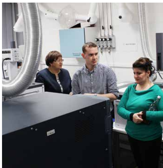
TRAINING ON POPs MONITORING. RECETOX CENTRE, MASARYK UNIVERSITY.