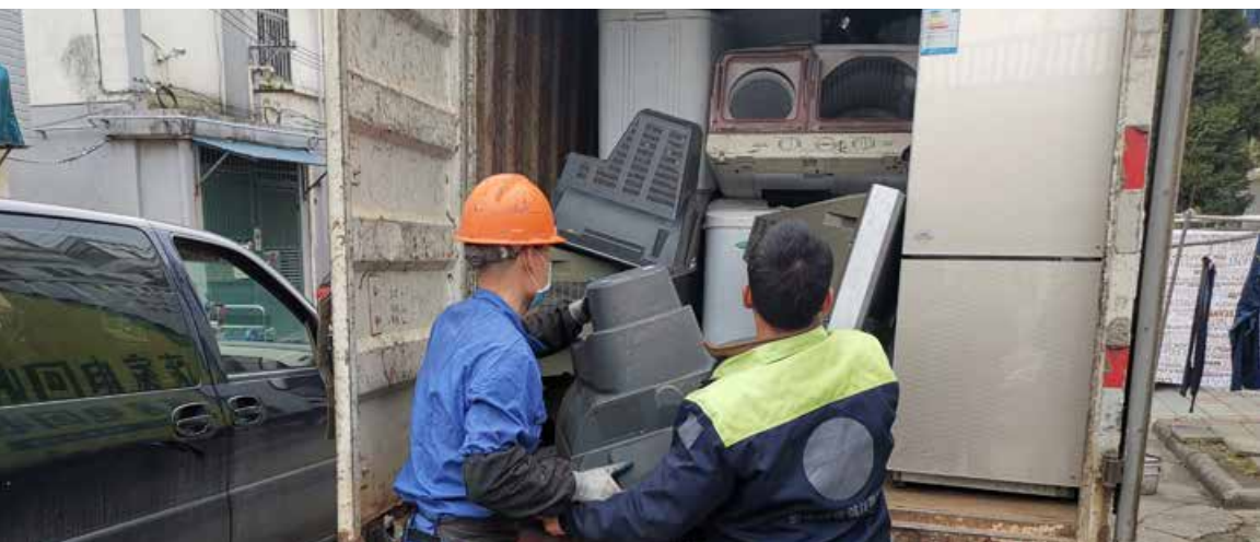
UNLOADING E-WASTE COLLECTED FROM NEARBY TOWNS.