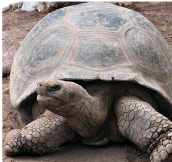
“CHELI” TORTUGA GALÁPAGO.