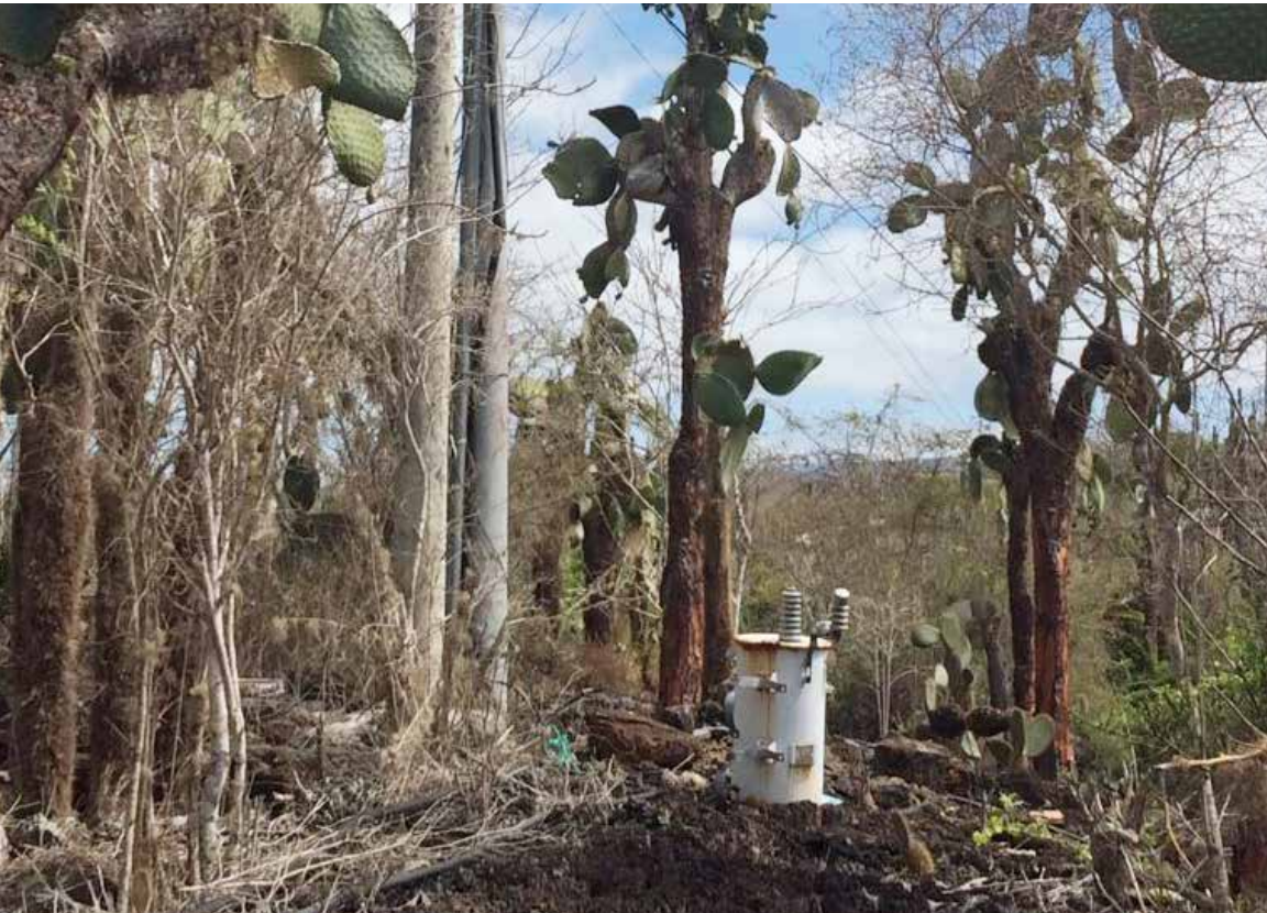
REPLACEMENT OF PCB CONTAMINATED TRANSFORMER (ISABELA, GALAPAGOS).