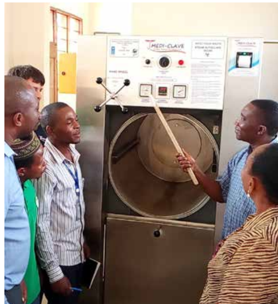
AUTOCLAVE OPERATION TRAINING.