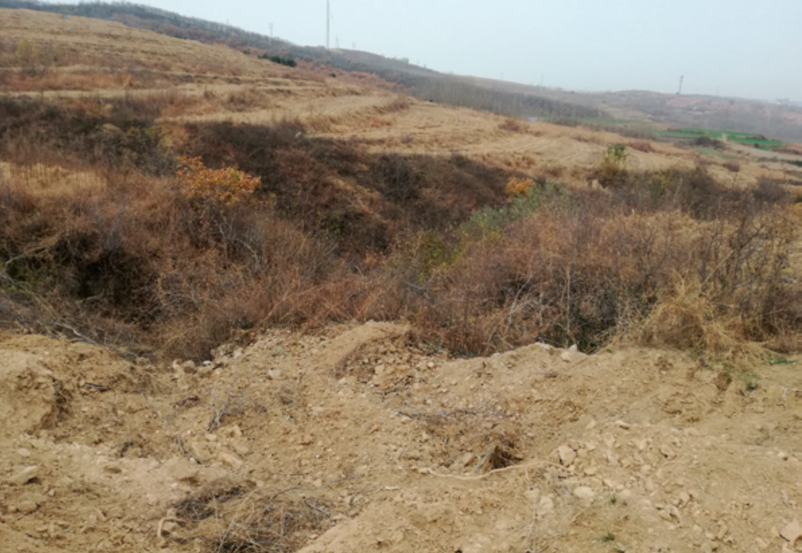
A before-and-after look at the forest rejuvenation programme in Zhucheng, Weifang, Shandong Province.