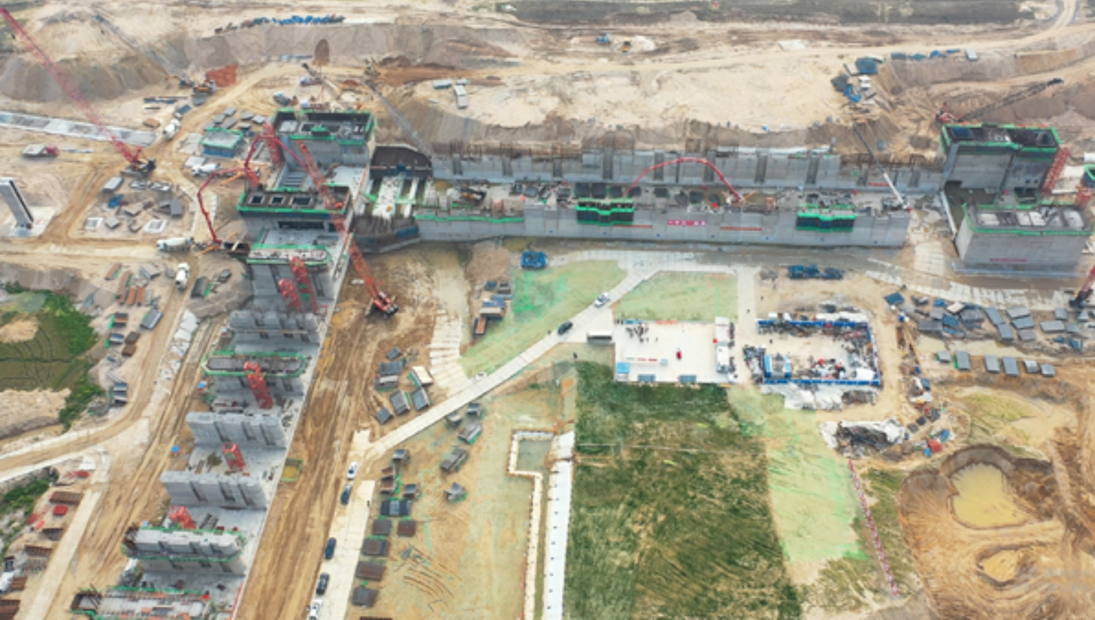
Construction of the first phase of the Jiangxi Xinjiang Bazizui Navigation Hydropower Hub.