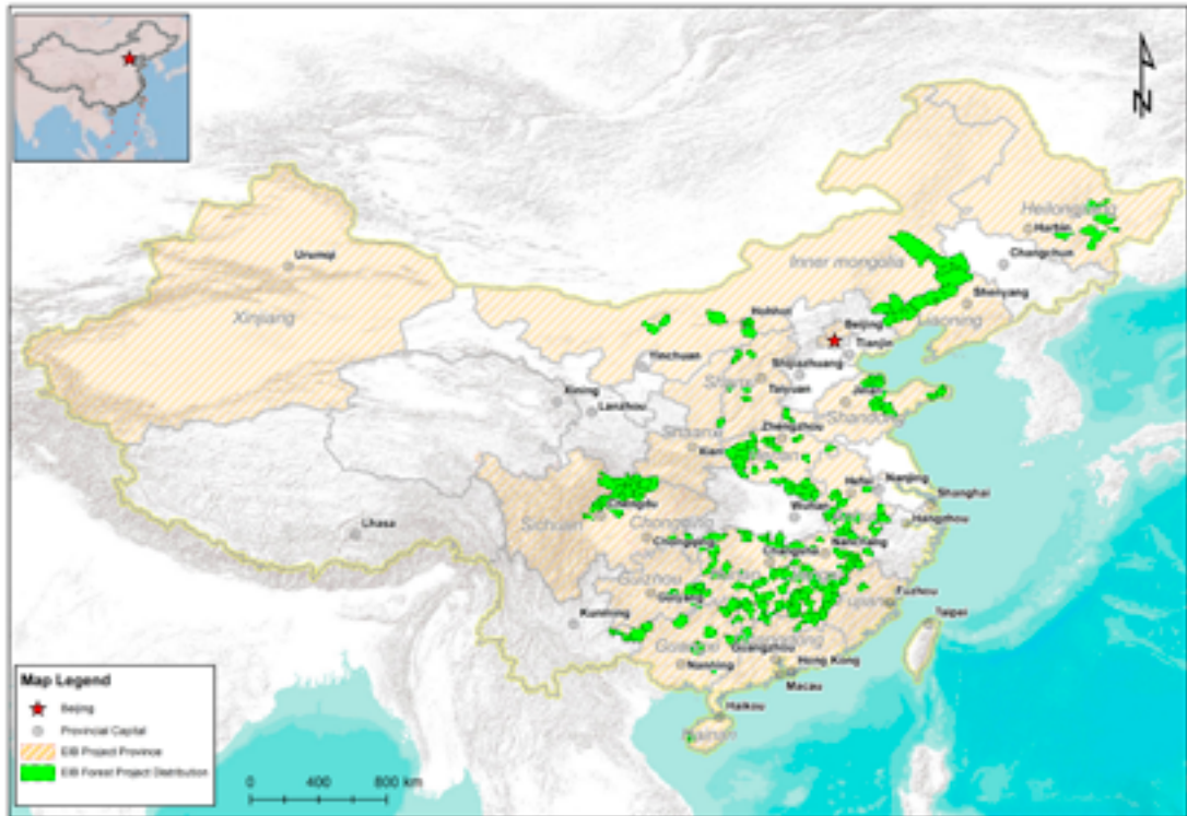
Chinese provinces with EIB projects, and distribution of forestry operations.