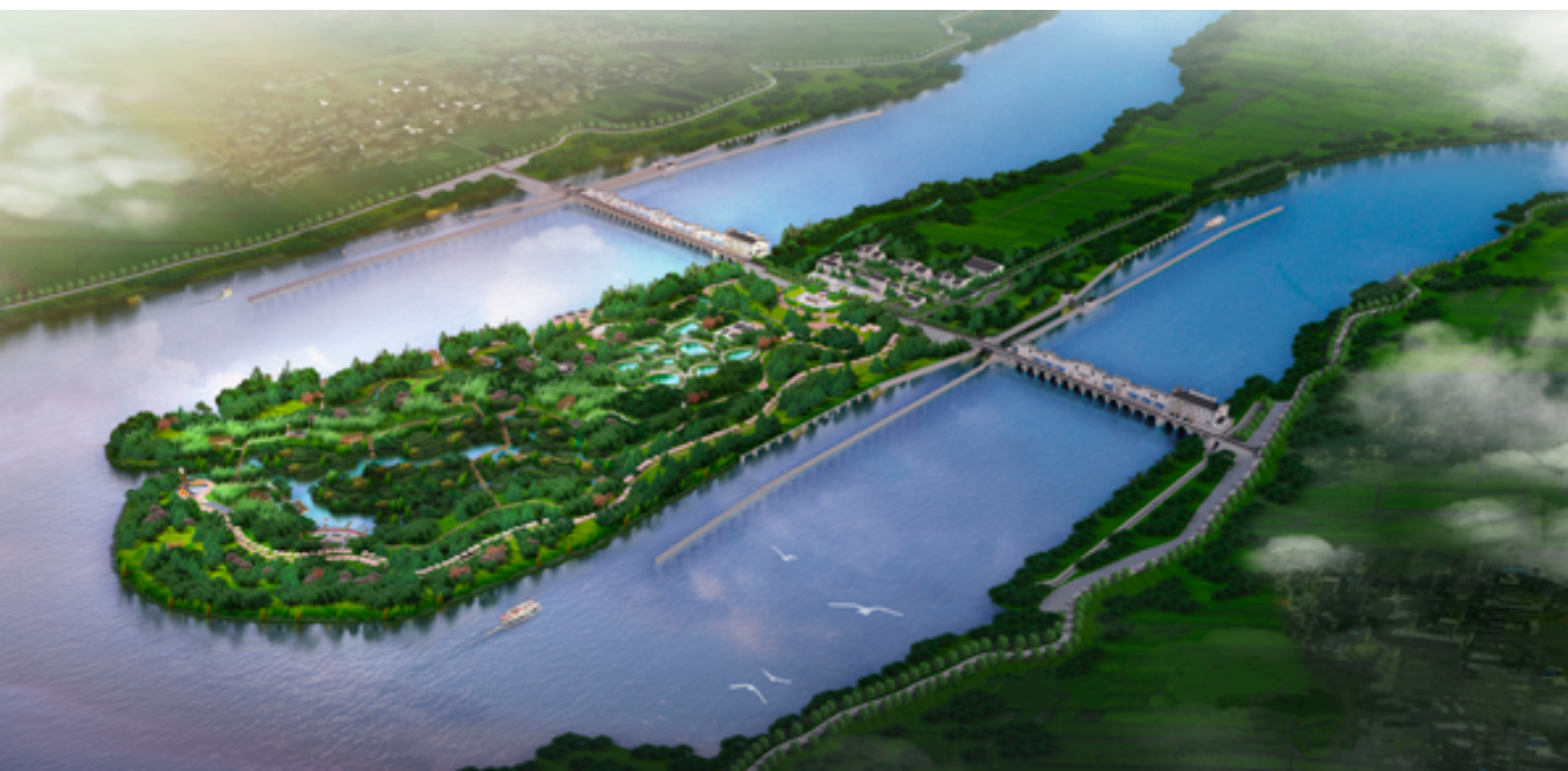
The Jiangxi Xinjiang Bazizui Navigation Hydropower Hub

The total investment in this water project was €600 million. The works included construction of the Bazizui Navigation Hydropower Hub in the lower reaches of the Xinjiang river, one of the five major river systems in Jiangxi. The Hub should be working by the end of 2022, and together with other navigation hubs and lock cascades, will significantly improve navigation on the Xinjiang river.