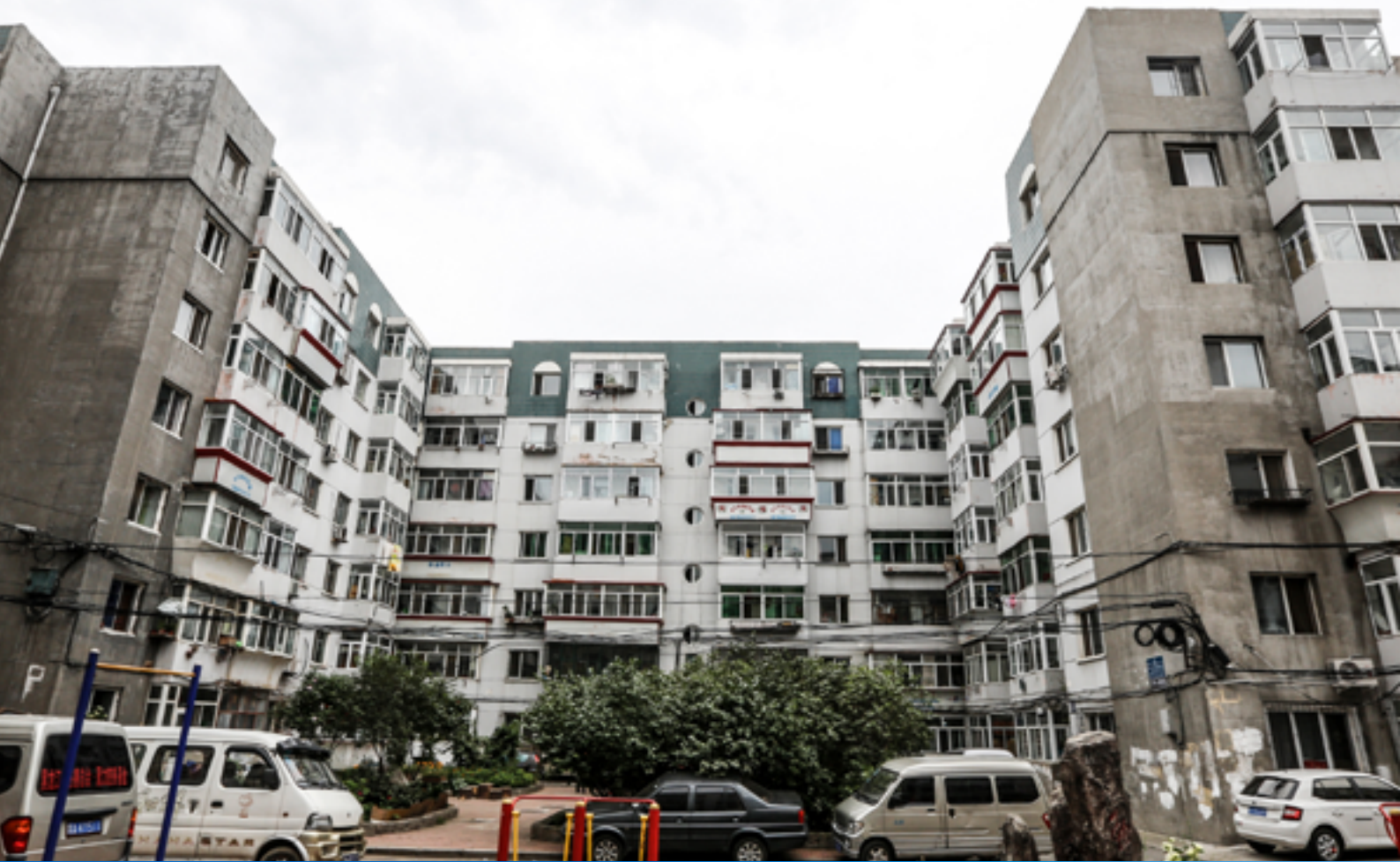
Building 37, Min'an Compound, Harbin, before and after the energy renovations.